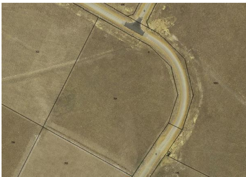
Lot 704, completely cleared and undeveloped.

Lot 704 Platypus Road, Hopetoun is 2.203ha in area, undeveloped and cleared of vegetation. The property is reasonably wet in the winter months.