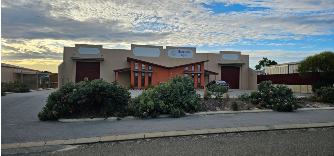
Figure 2 - Units 5 and 6, 99 Tamar Rd Hopetoun