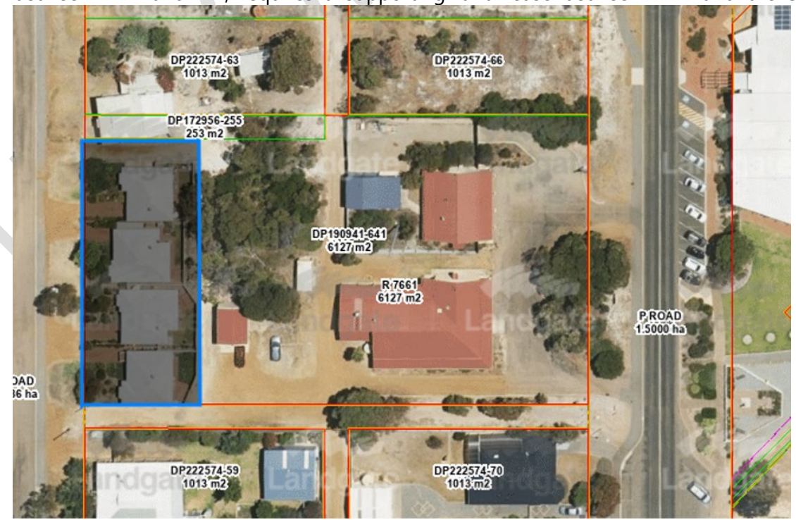
Figure 2 - location map Units 1 to 4, 26 Barnett St, Hopetoun