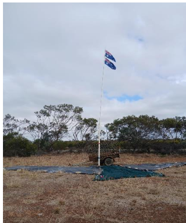
Photo displaying the approx. specific land area and height (with a flag pole) of the Boeing 737 plane tail which would reach 11 metres into the air.