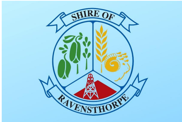
Option A: The Shire of Ravensthorpe logo on a light blue background.