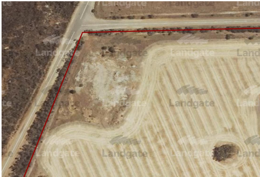
Photo of the south corner of the intersection of Hopetoun-Ravensthorpe Road and Jerdacuttup Road showing the former main roads gravel pit.