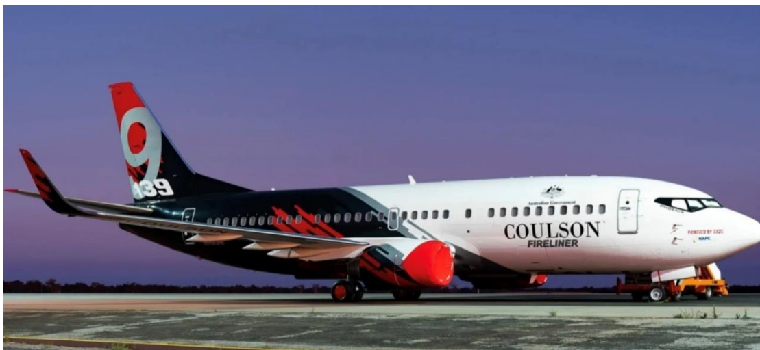
Photo of the Coulson Fireliner 139 Boeing 737 Water Bomber