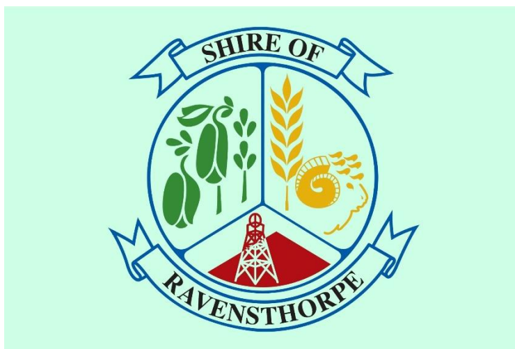
Option B: The Shire of Ravensthorpe logo on a light green background.